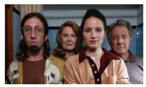
Wednesday, February 22, REGISTER at 1:00 p.m. ON ZOOM The Wife

Wednesday, December 14, REGISTER at 1:00 p.m. ON ZOOM God of the Piano Wednesday, January 18, REGISTER at 1:00 p.m. ON ZOOM As They Made Us